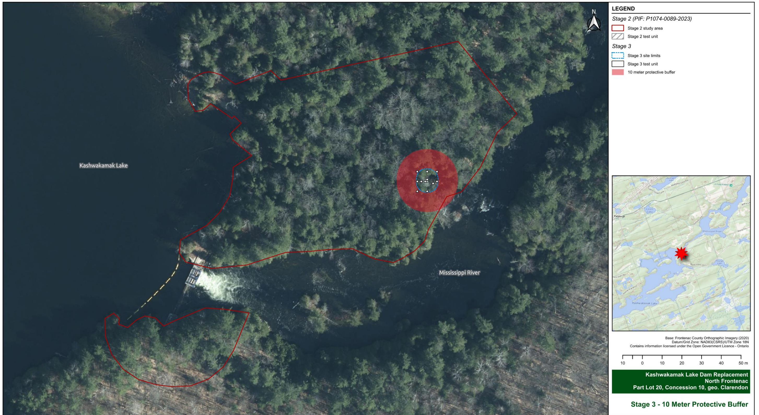
Map 5. Recent (2020) orthographic imagery showing Stage 3 protective buffer and monitoring buffer.