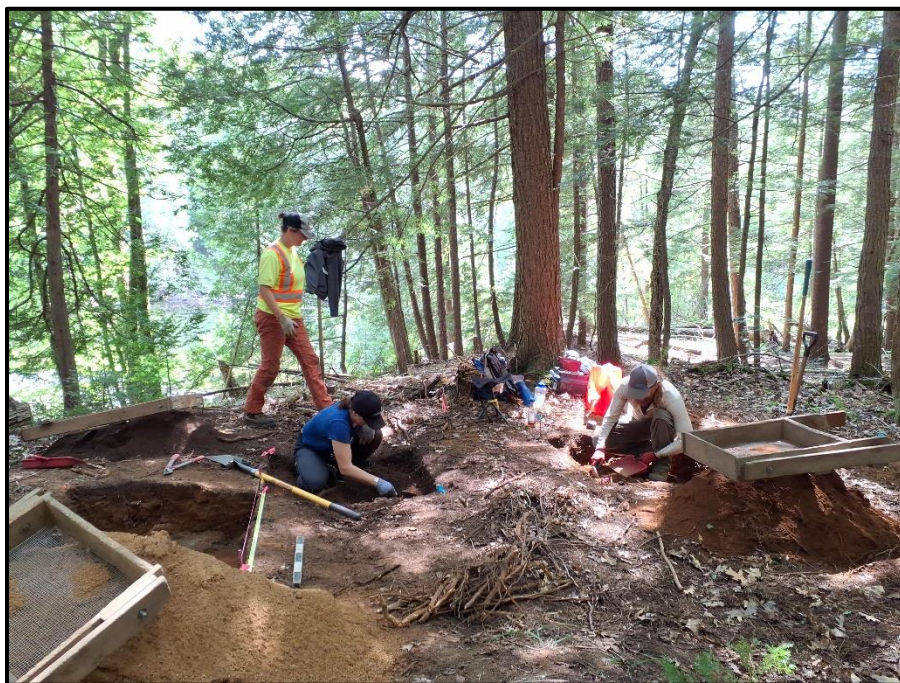
Image 2. View of field crew excavating infill test unit, facing south. (PR24-040D041)