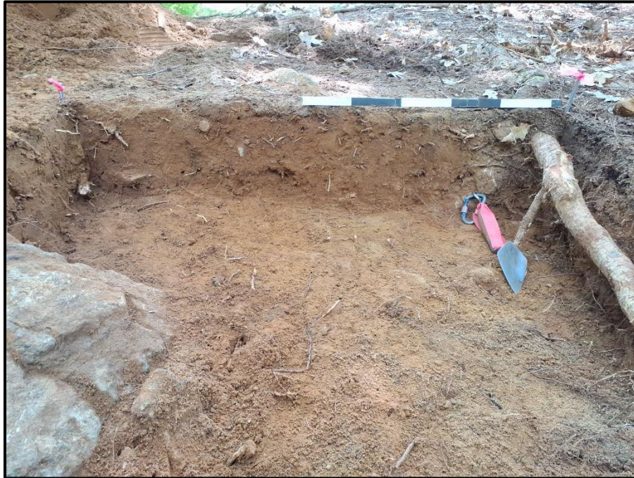
Image 3. Test unit N500 E205, closing, south profile. (PR24-040D005)