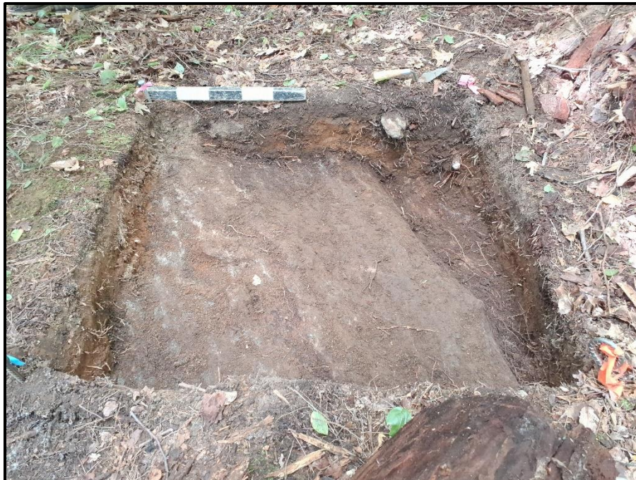
Image 7. Test unit N510 E205, closing, west profile. (PR24-040D009)