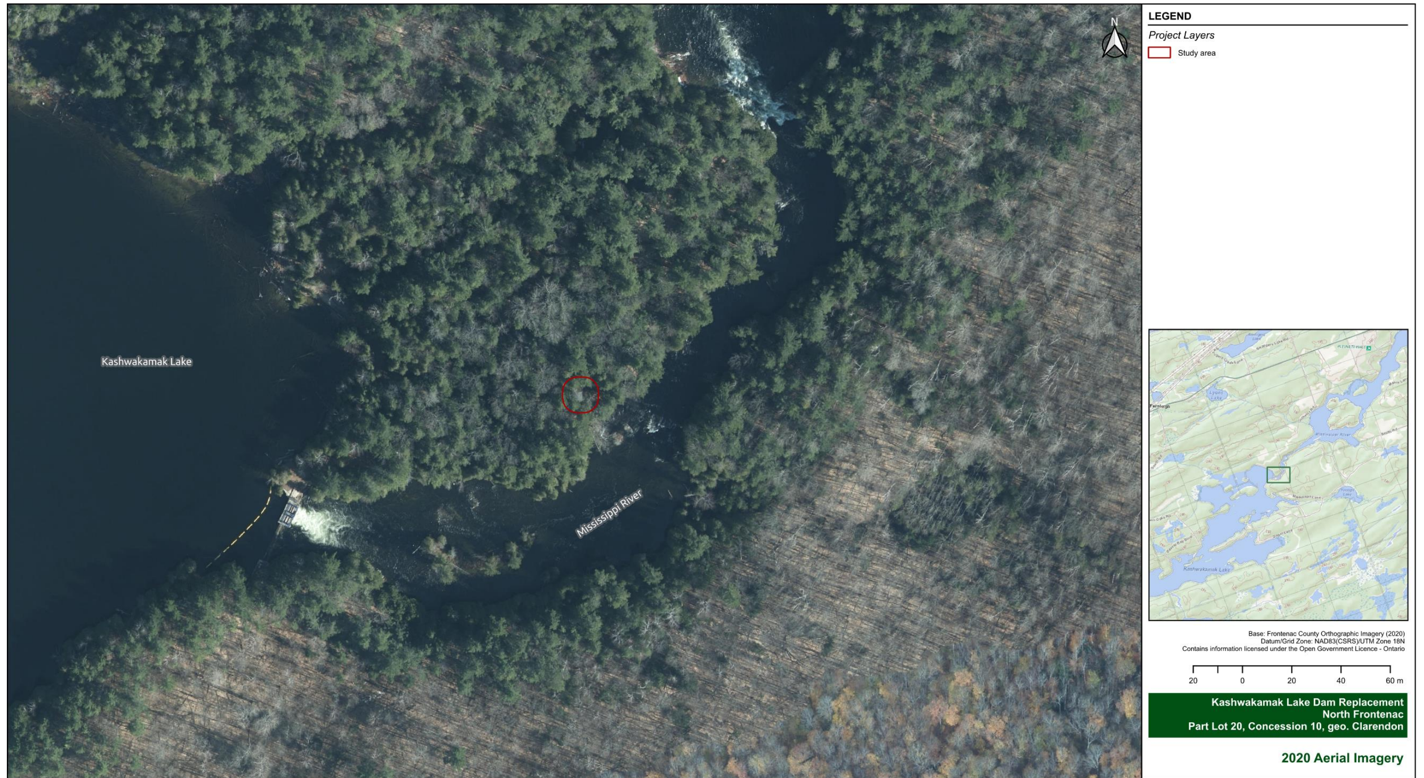
Map 2. Recent (2020) orthographic imagery showing the study area.