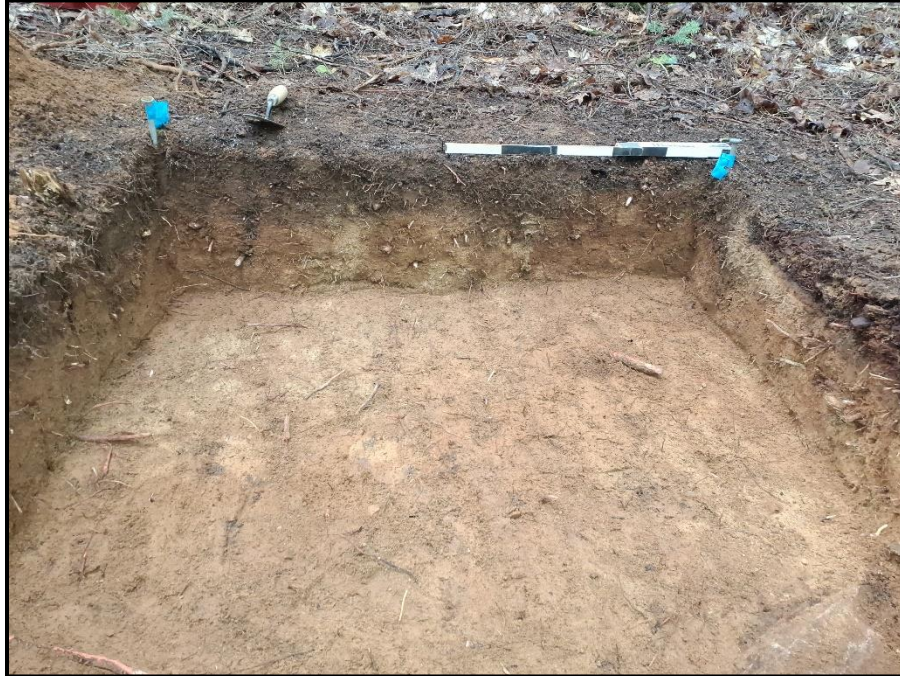
Image 6. Test unit N510 E200, closing, south profile. (PR24-040D020)