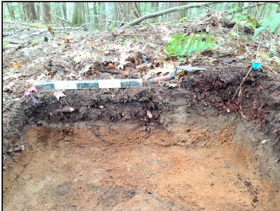
Image 4. Test unit N500 E200, closing, west profile. (PR24-040D028)