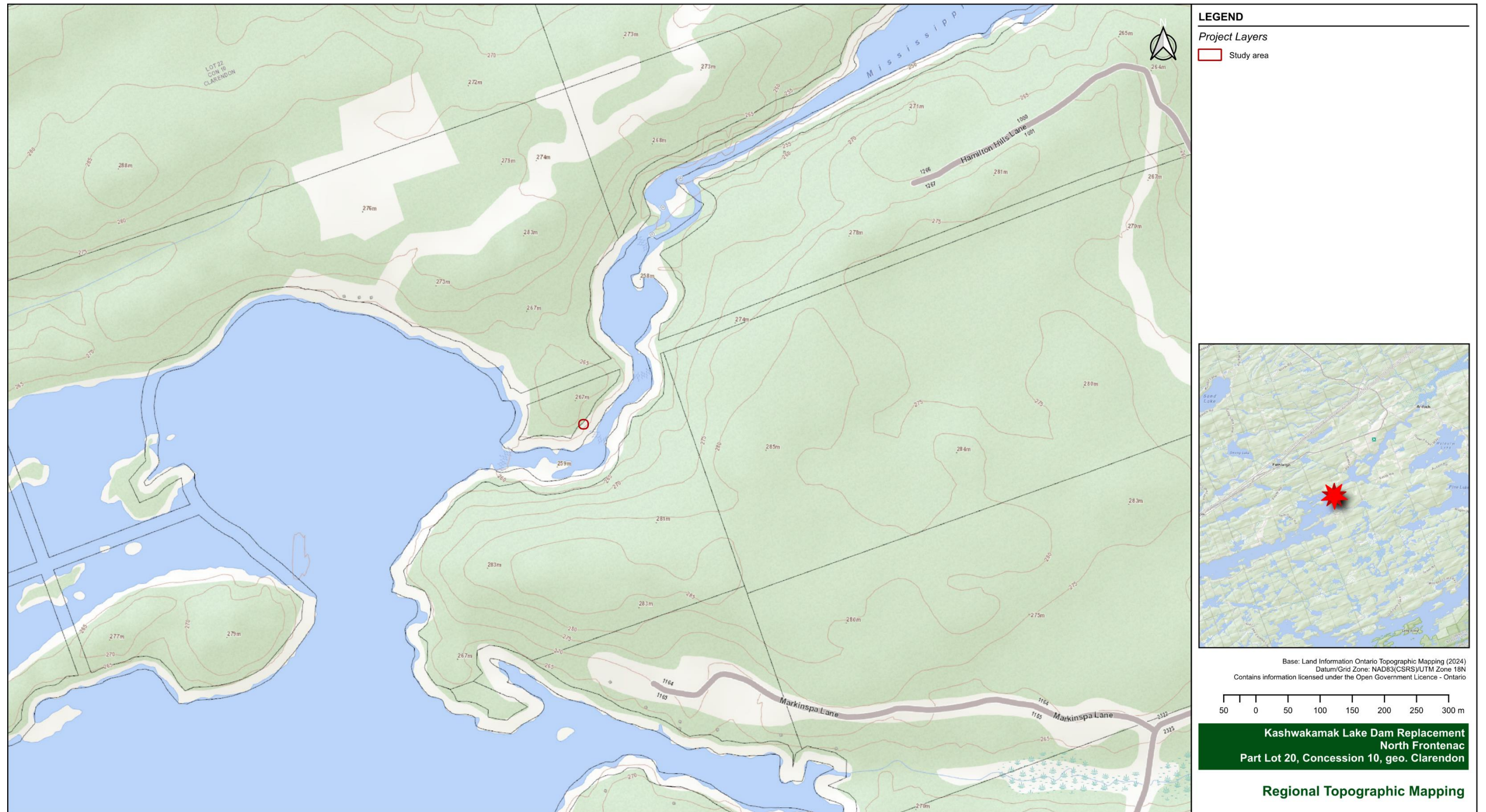
Map 1. Location of the study area.