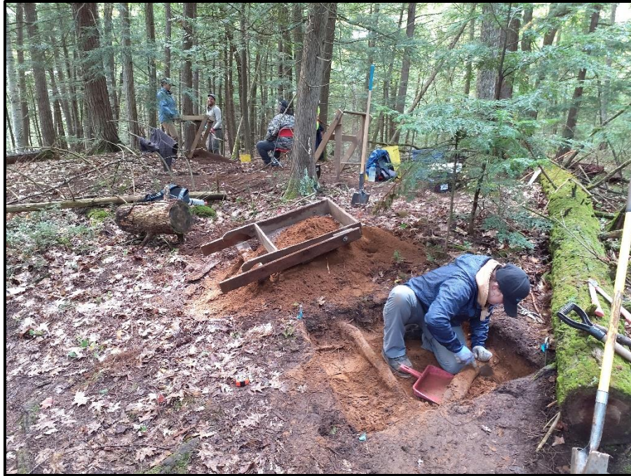
Image 1. View of field crew excavating test unit on 5m grid, facing northwest. (PR24-040D012)