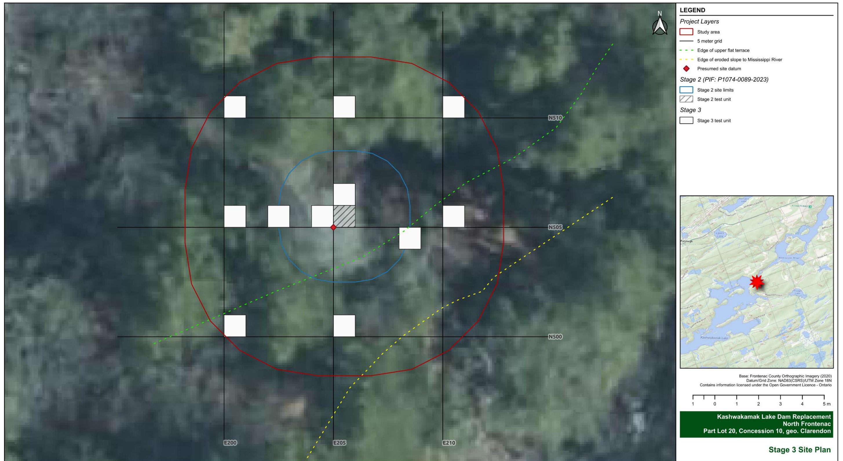
Map 3. Recent (2020) orthographic imagery showing Stage 3 site plan.