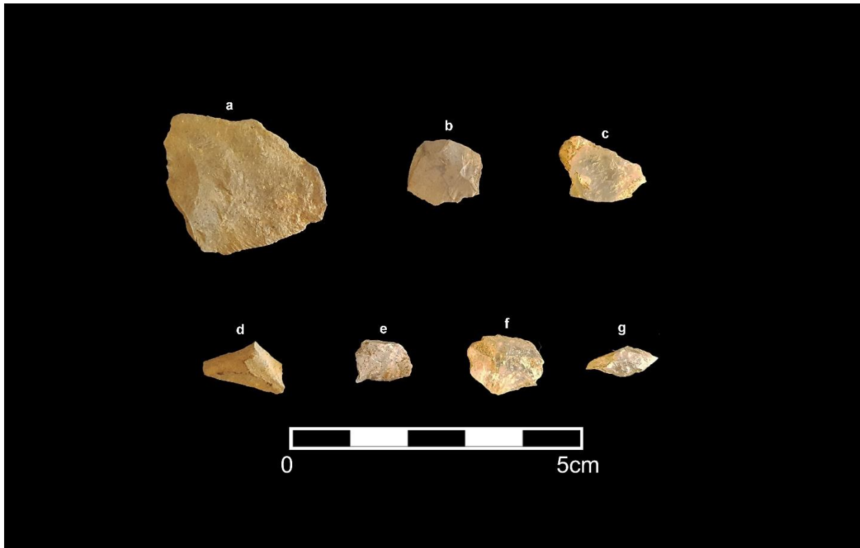
Image 8. Sample of Lithic Artifacts.

a: kichessippi chert chipped stone utilized flake, N506E205:2 (#1016); b: Onondaga chert chipped stone tertiary flake, N506E205:1 (#1007); c: quartz chipped stone broken/partial flake, N506E205:2 (#1019); d: kichessippi chert chipped stone broken/partial flake, N506E205:2 (#1018); e: quartz chipped stone secondary flake, N505E202:1 (#1000); f: quartz chipped stone flake, N510E210:2 (#1003); g: quartz chipped stone shatter, N506E205:1 (#1009)